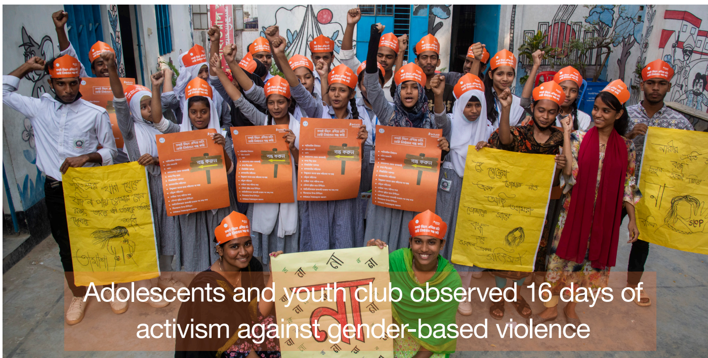
Adolescents and youth club observed 16 days of activism against gender-based violence

Every year, Educo's adolescents and youth clubs observe 16 Days of Activism Against Gender-Based Violence , which commences on 25 November, the International Day for the Elimination of Violence against Women, and ends on 10 December, International Human Rights Day, signifies that violence against women is the most pervasive form of violence against human rights worldwide.